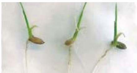
Healthy seedlings (10 days)