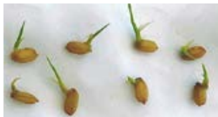
Damaged seedlings (10 days)