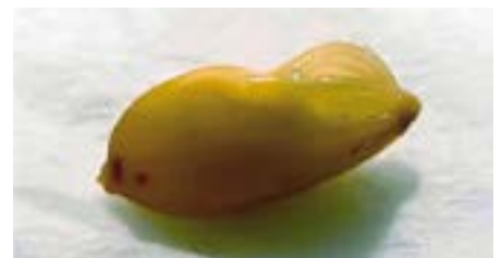
Completely destroyed seedlings (10 days)